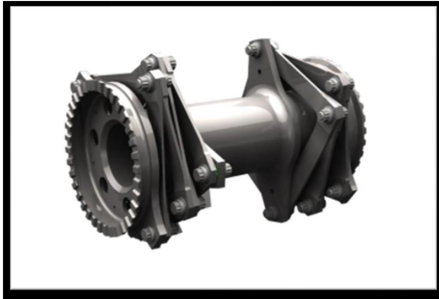
Figure 1 - Kamatics Corporation KAflex drive shaft assembly

Specifically, CASA considers that the word “Condition” is inadequate to describe a proper check of the drive shaft flexure plates during the pre-flight check in the powerplant area and may result in the person checking the drive shaft missing vital indications that may affect continuing airworthiness of the drive shaft.