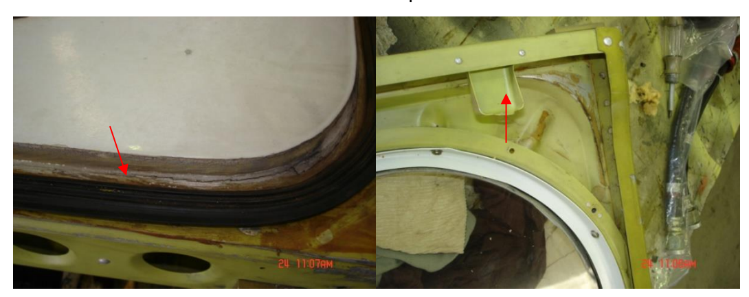
Figure 1. This aircraft contained a crack in the door structure that was detectable from the outside.

A similar internal crack finding was reported recently on a Beech B300C aircraft where an operator reported that a crack was found during a scheduled high utilization inspection program check on the inside of the Emergency Exit door curved panel at the lower aft door corner, but that the crack found was not otherwise apparent from the outside direction that the Beech 300 Maintenance Manual visual inspection calls for.