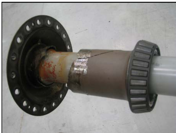
Figure 1 Failed gear carrier assembly.

The key factors in the above three failures are, that each helicopter was based and operated in Northern Australia, and were not stored under cover, in hangars.