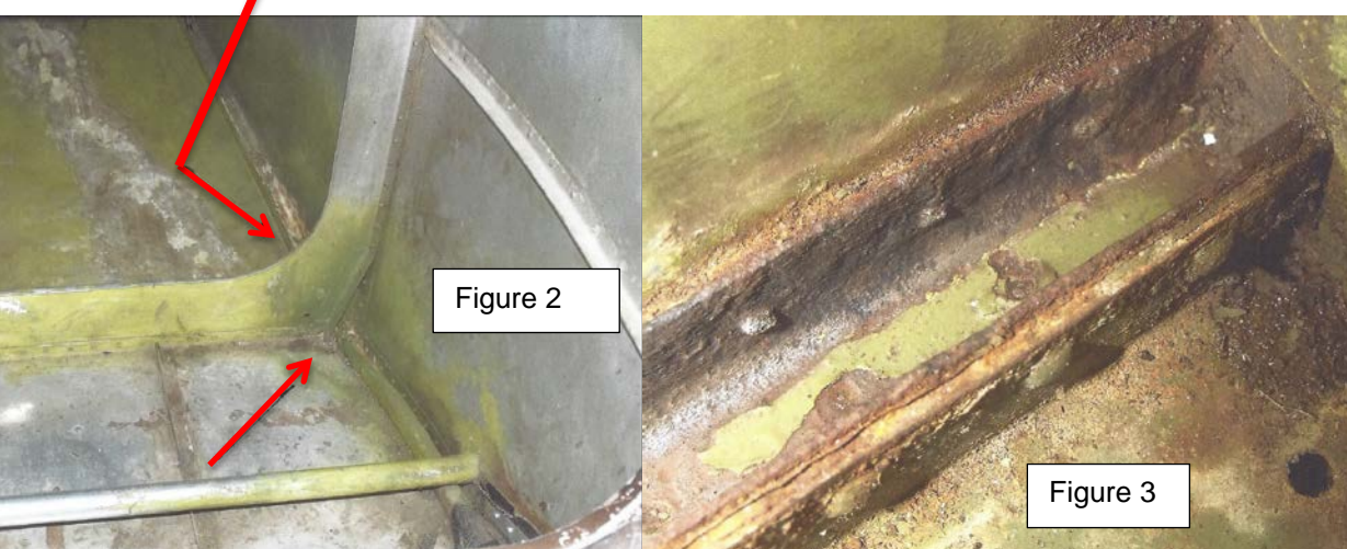
Figure 3 illustrates the corrosion damage found.

Figure 2 identifies the specific area of concern.