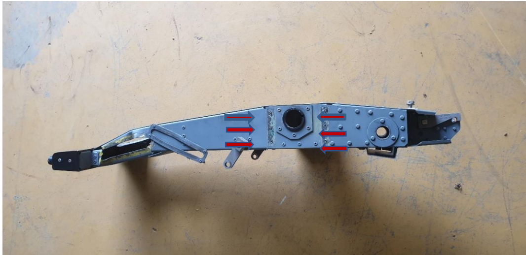
Figure 1: Seat spine, as removed, showing rivet failure as indicated. These rivets attach part of the armrest structure. Refer to relevant CMM for details.