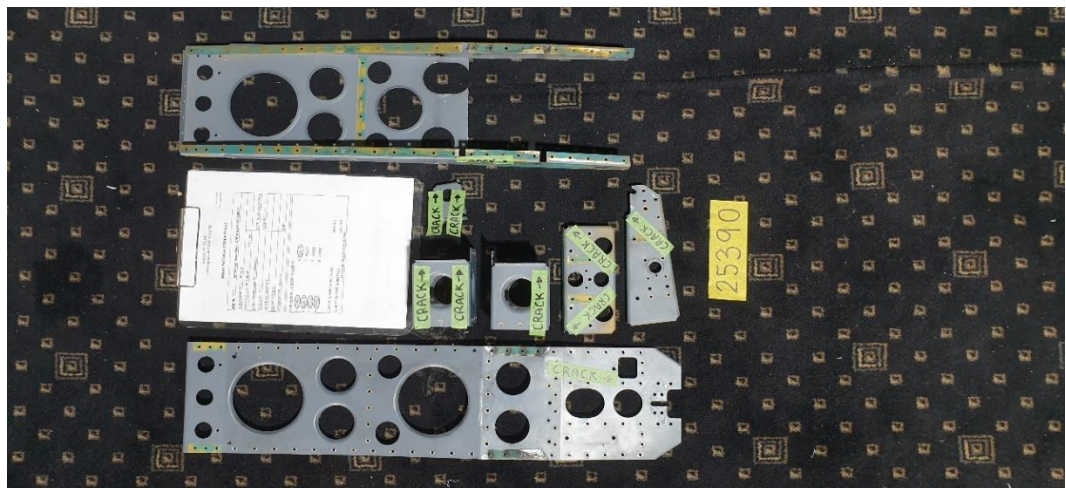
Figure 3: After the seat spine was disassembled, these defects were found