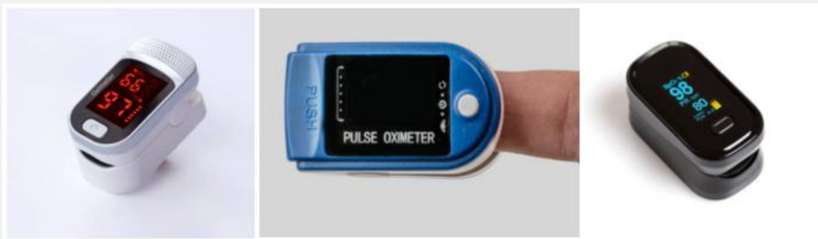
Figure 4: Electronic oximeter devices available for personal use