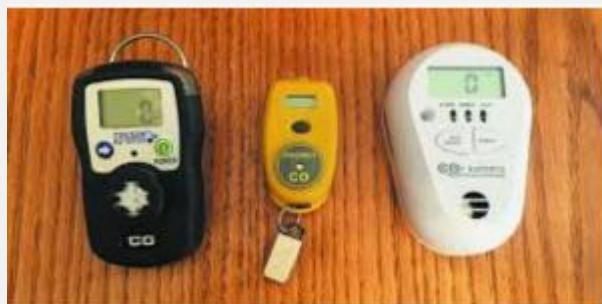
Figure 3: Electronic CO detector devices available for personal use

Aircraft certified and hard-wired products are also available that can be installed by approved maintenance repair organisations. Reliance on only the visual CO indicator placard, that changes colour in the presence of CO, is considered suboptimal. If the aircraft is only fitted with the placard type CO indicator, the operator should ensure the placard is placed in the field of view of the pilot, is regularly checked to ensure that the placard is not time-expired and that the indicator is not faded from ultraviolet exposure or contamination.