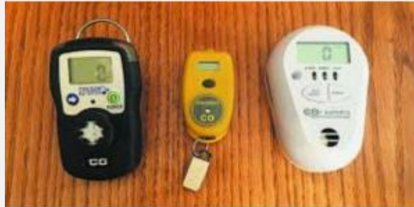
Figure 2: Electronic CO detector devices available for personal use

and visual warnings when escalated CO levels are detected. Examples of small electronic personal devices are shown in Figure 1.