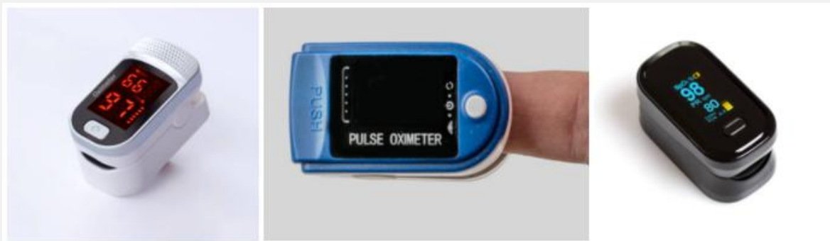
Figure 3: Electronic oximeter devices available for personal use