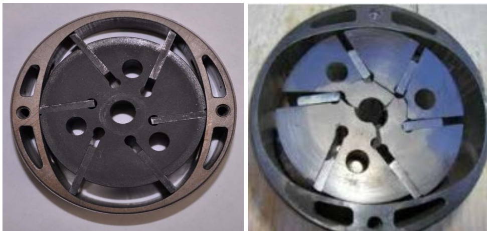
Figure 2 - Internal view of a serviceable dry vacuum pump (left) and a failed pump (right)

A short introduction to the design and construction of the typical dry vacuum pump (or air pump) may assist in understanding why pumps fail. Dry vacuum pumps are simple positive displacement pumps. Carbon-graphite vanes sit loosely inside a central carbon-graphite rotor which is located inside a round steel housing with an oval cavity, in which sit the rotor and vanes (see Figure 2).