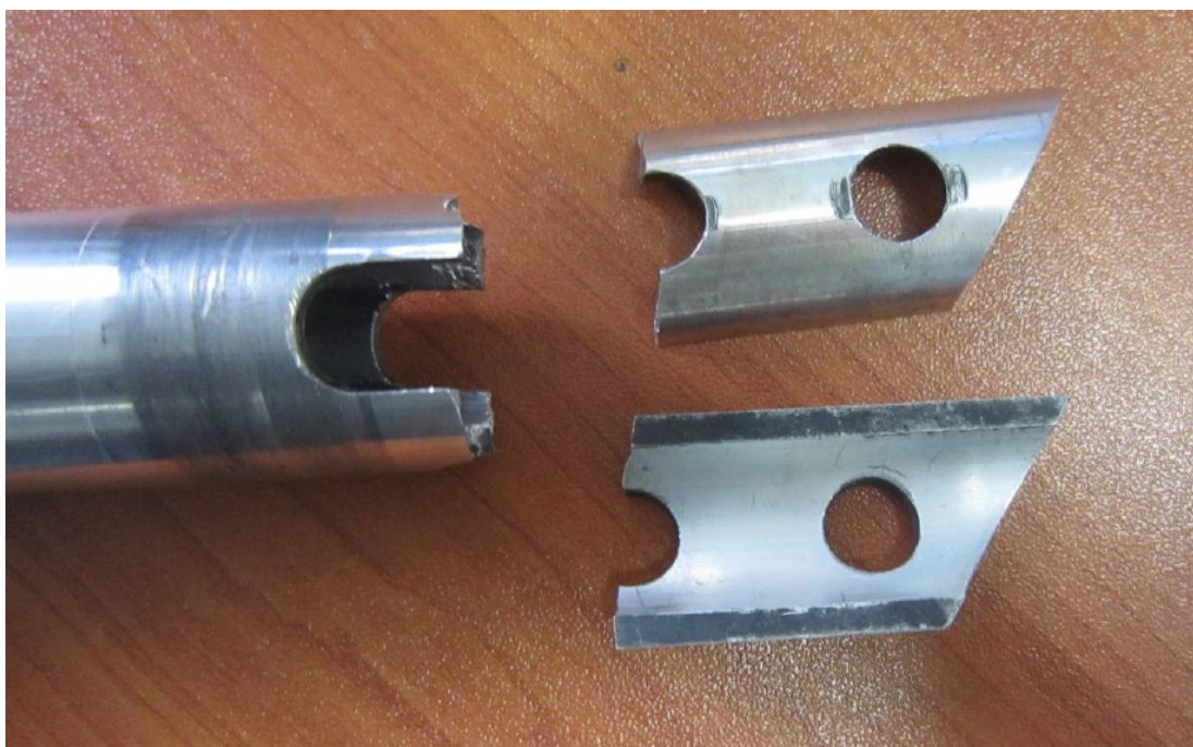
Figure 3: Failed aileron control tube