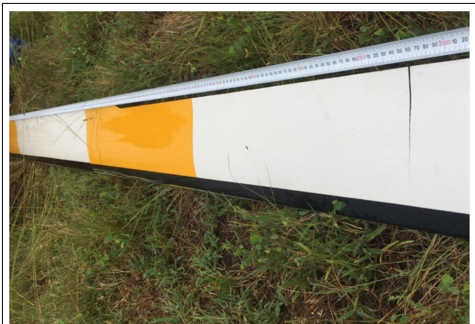
Figure 1 – Location of crack

During low level operations at slow airspeed the pilot of a Robinson R22 Beta II helicopter experienced an unusual increase in vibration levels and commenced a landing. Shortly before making a successful landing and whilst in the hover the pilot reported an increase in vertical vibration levels and a decrease in power available. Subsequent inspection revealed a crack approximately 160 mm in length emanating from the trailing edge and running chord wise toward the D section spar; refer to figure 1.